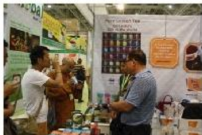
Xiamen Tea Exhibition 2014 Sri Lanka Pavilion

目前纯正锡兰红茶享有关税减半的优惠，将来若与中国签署自由贸易协定将给茶叶出口商带来更多的税收优惠。